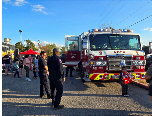
Fall Festival visit from SAFD