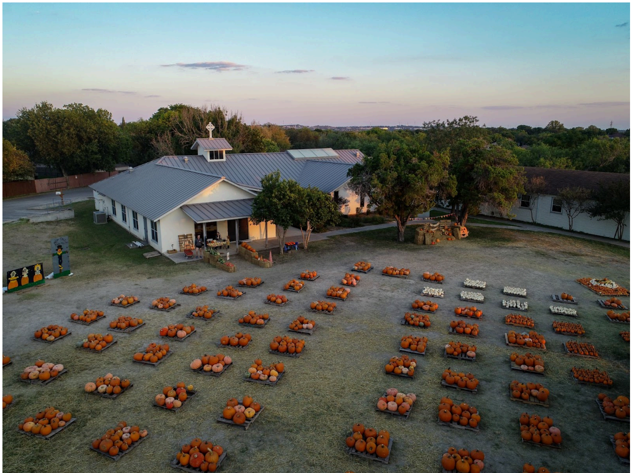
St. Margaret's - Aerial View

With our future in mind, in 2021 St. Margaret's developed a Vivid Vision of how we envisioned our community would look on Pentecost in 2024. The Vision incorporated a three-year plan, allowing us to continually revisit the Vision as we moved toward Pentecost 2024; this work has served to guide us and remind us where God was leading us. The work focused on the 3 main areas: worship, nurture and outreach. For a complete look at this Vivid Vision click HERE . As we close out 2024, we look forward to working with our new rector to develop our next 3-5 year strategic plan.