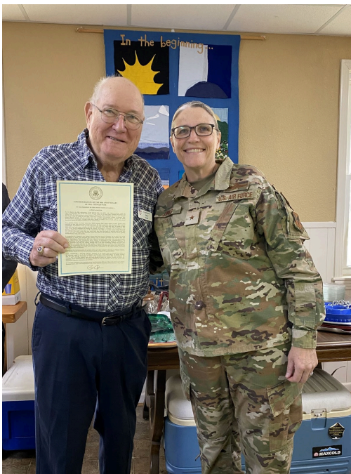
Honoring our Veterans

"That we serve the Lord with all our hearts and love our neighbors unconditionally."