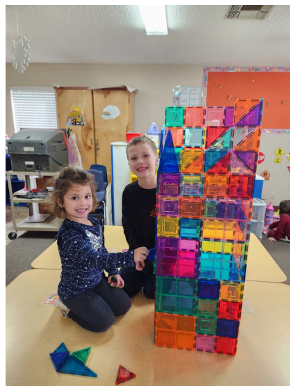
Building a tower with geometric shapes