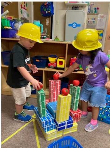
Construction workers hard at work

Staff maintains current certifications in teaching, first aid, and CPR