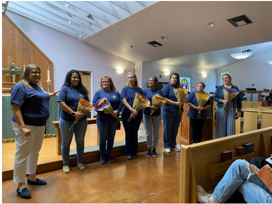
Honoring our teachers on Episcopal School Sunday