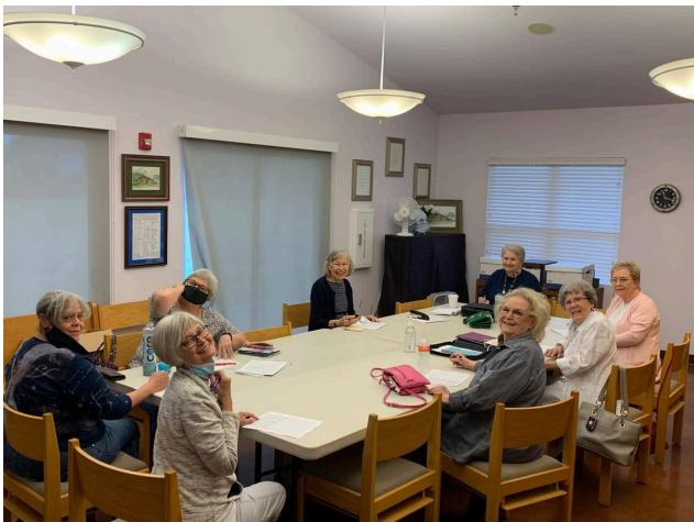
Episcopal Church Women