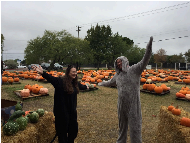
Pumpkin Patch Shenanigans