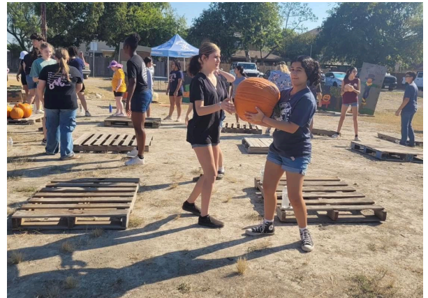
Community helpers on Pumpkin Patch Set-up Day