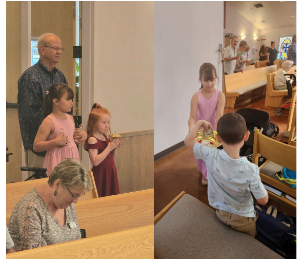
Youth Sunday Ushers