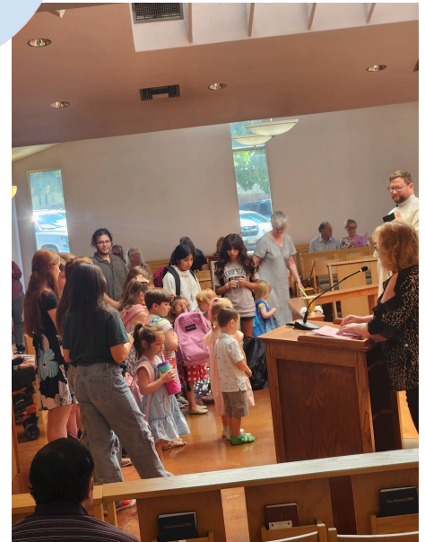
Back to school Sunday Blessing of the Backpacks