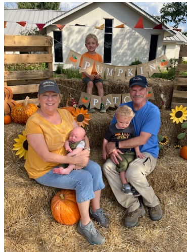
Photo Op with the Grands