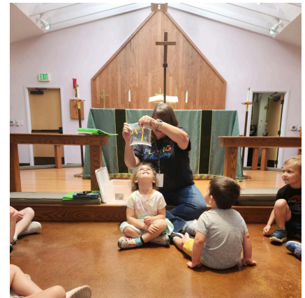
Chapel time with the Head of School

St. Margaret's accepts all children regardless of race, color, or creed