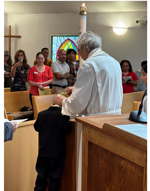
All Saints Sunday Baptism

Baptisms, Confirmations; and Received by Bishop: 15