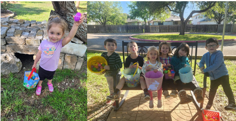
School Easter Egg Hunt