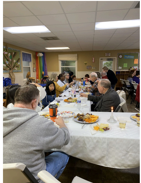
Maundy Thursday Agape Meal