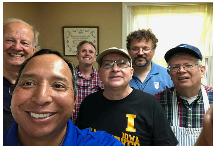
Brotherhood of St. Andrew