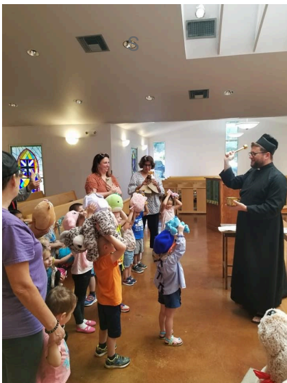
Blessing the "stuffed" animals during Chapel