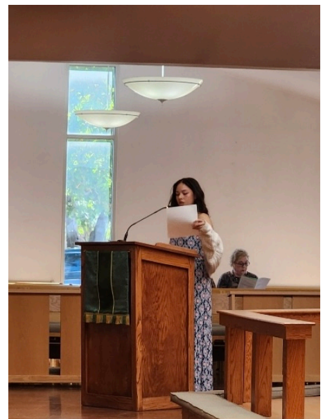
Youth Sunday Lector