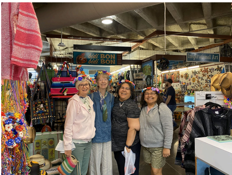
Ladies Night Out