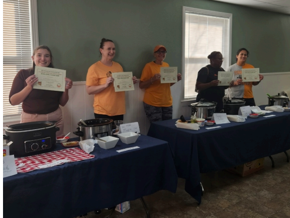
Chili Cookoff Participants