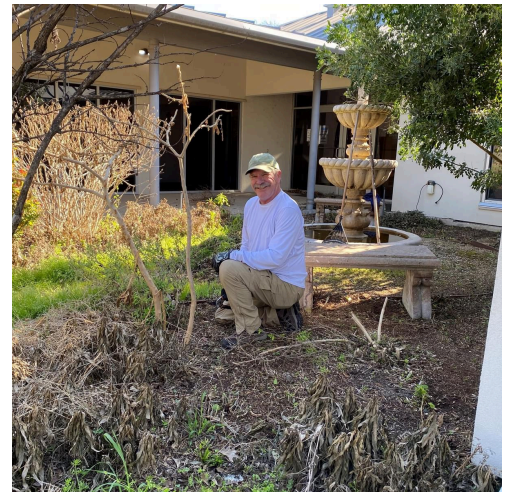
Church Campus Cleanup Day