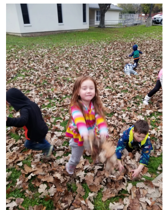
Playtime in the leaves