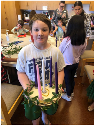
Youth making Advent wreaths